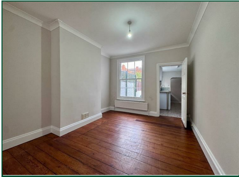
GROUND FLOOR 397 sq. ft. (36.9 sq.m.) approx.